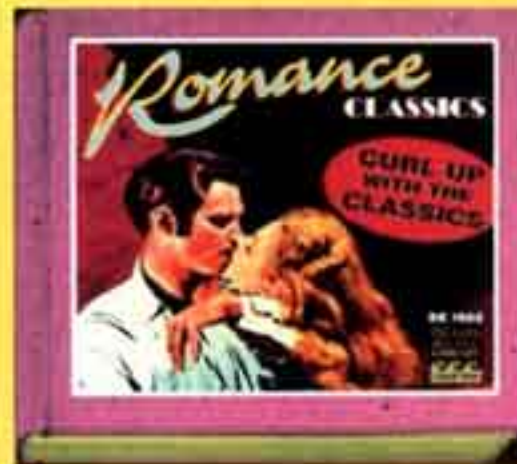
DE 1602 ROMANCE CLASSICS