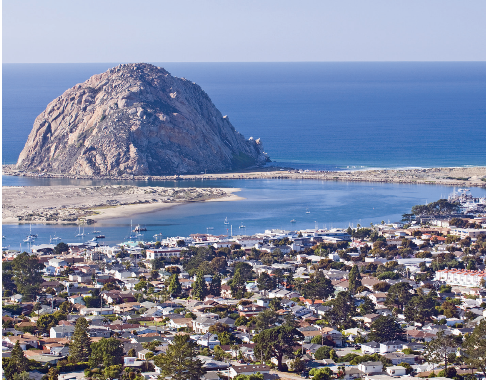
“Morro Rock and Bay from Black Hill,” Morro Bay, California, by Rich Reid